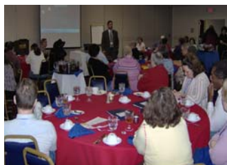
Exciting presentations and workshops were offered.