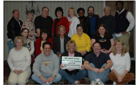
WVMHCA WRAP Facilitators

Wellness Recover Action Planning Training of Facilitators January 06