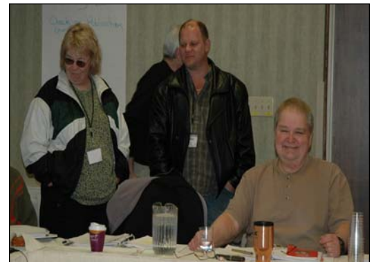
WRAP participants learn about recovery topics and wellness tools promoting self-maintenance and recovery